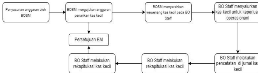
Figure 2 - Cash Receipt Procedure Chart of Bank BSI KCP Surabaya Ampel

Cash operational activities at Bank BSI KCP Surabaya Ampel which are illustrated in the procedure chart are as follows.